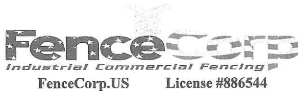
EXHIBIT 1 - LETTER OF ASSENT